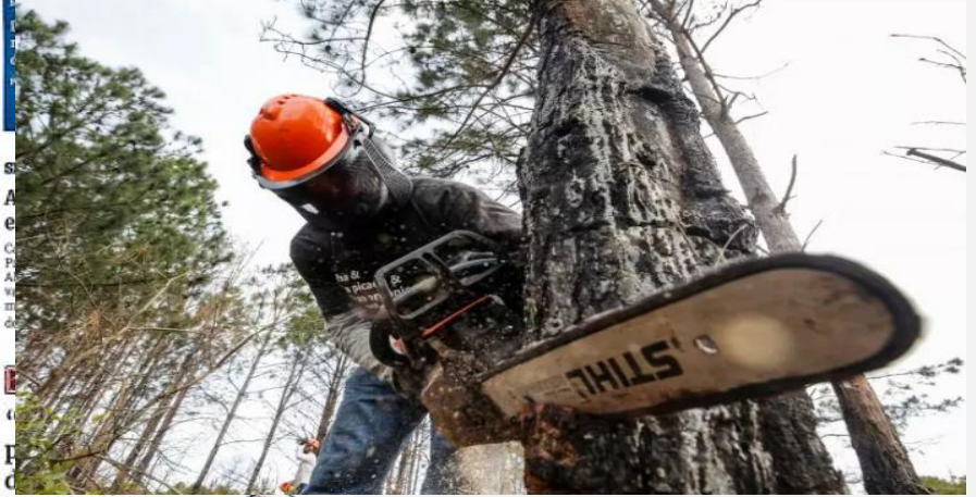
m entrevista ao fao mo ND.

A espécie invasora é propagadora de chamas por sua resina inflamável, além de provocar o extermínio da flora nativa por consumir espaço, nutrientes, água e luz solar.